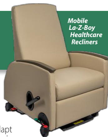
Mobile La-Z-Boy Healthcare Recliners

HOW YOU RECLINED, RELAXED, AND REVITALIZED PATIENT CARE!