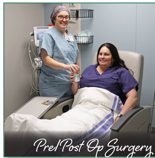
Prel Post Op Surgery

Together, we are fostering an environment of healing and comfort, making a noticeable difference in the lives of those we serve. We are extending our sincerest thanks to you for your invaluable support in transforming patient care.